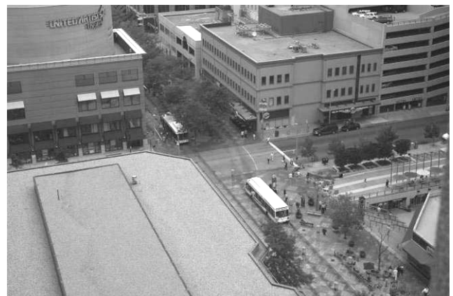
Hotel View of the 16 th Street Pedestrian Mall that runs through the center of downtown and the frequent free shuttle buses that run daily.