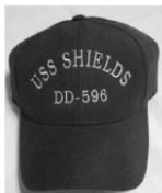
#1036 USS Shields Hat