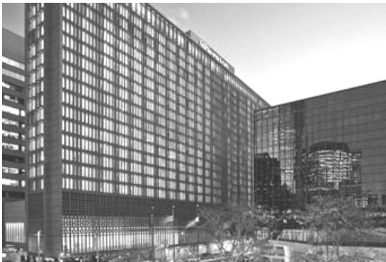
Exterior Photo of the Sheraton Hotel Downtown Denver formally the Adam's Mark site of our 2005 reunion.